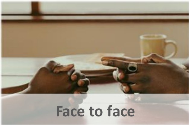
Face to face